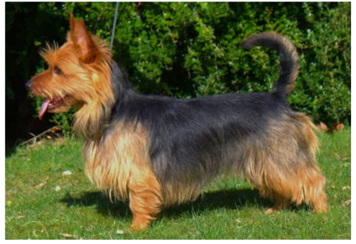
#6- Kisamba's Sparkling Cocktail "Simba" (Male) Owner: Irene Thye 187 Points <a href="http://www.kisamba.dk">http://www.kisamba.dk</a>