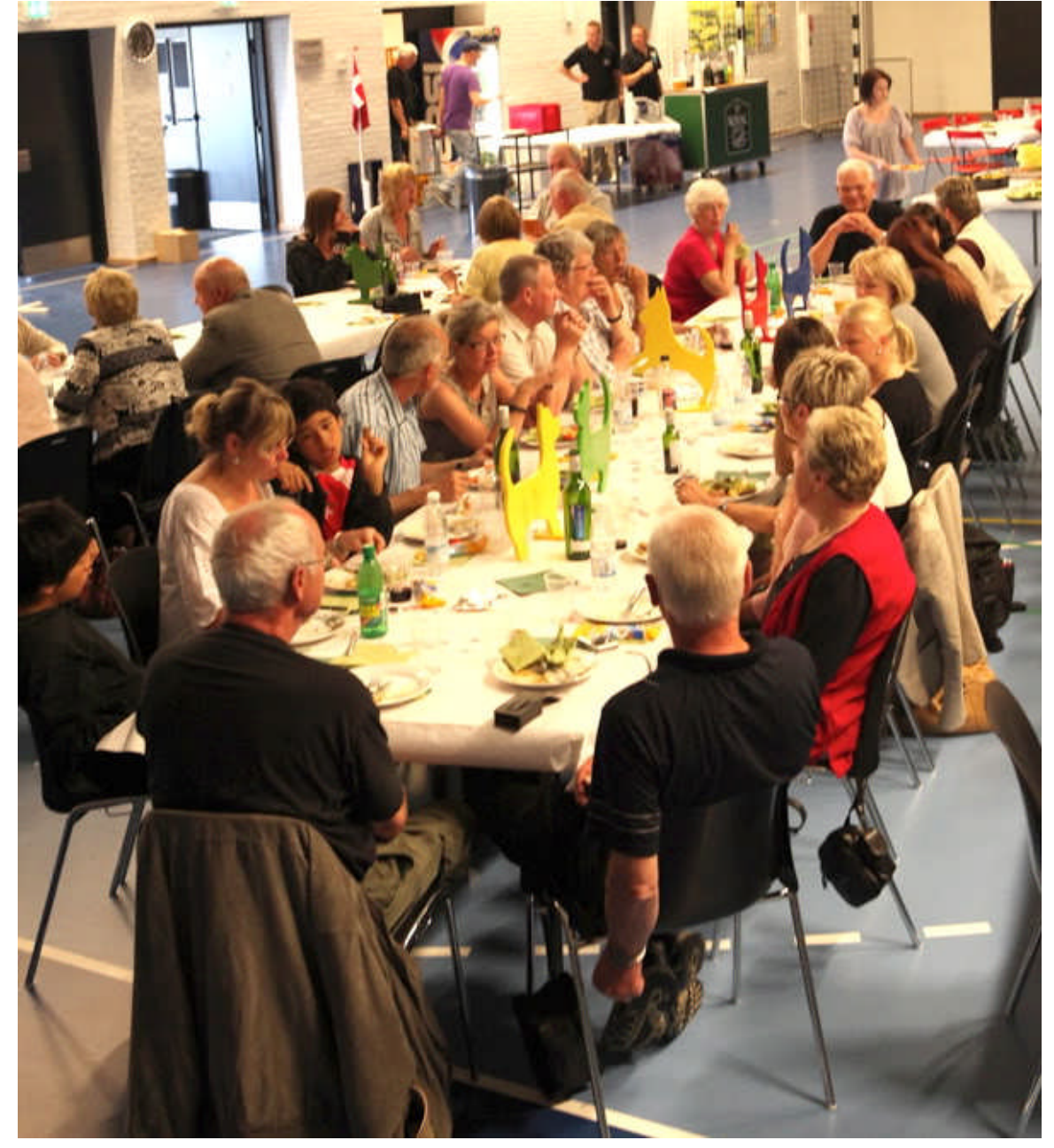
The two days following the World Show, there were Terrier Specialties that took place in a different location. Following the Specialty there was a lovely dinner.