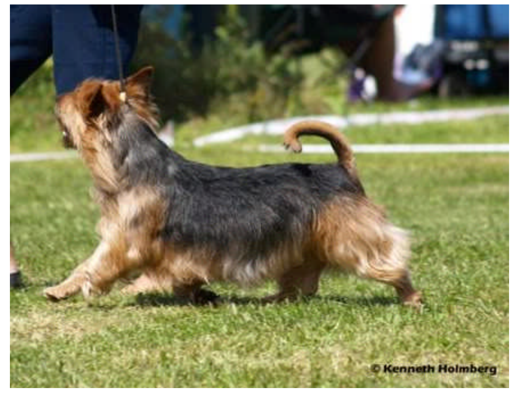
Ch Devil in Disguise av Falchebo Illustration of how correct anatomy translates into correct movement.

Finally I think we see many dogs that could be better proportioned. Many are very long and very low - I have bred a few myself.