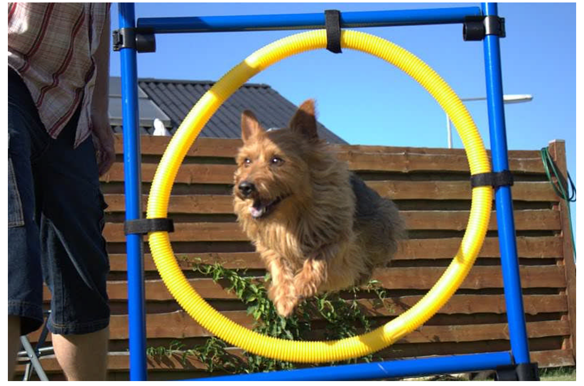
"Bastian" enjoying agility!