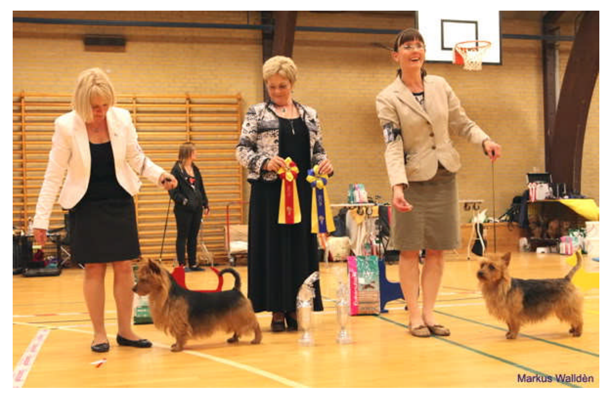
The Winners at the Aussie Specialty