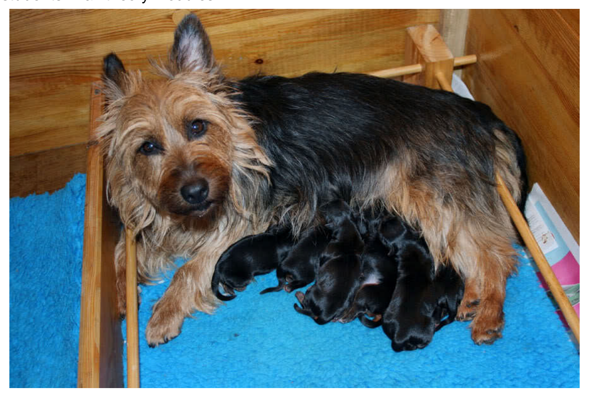
Would you like to see the number of Aussie owners and breeders in

USD and the World Classes are taught by trained kennel consultants, behavioral consultants, veterinarian, and legal gains. On each team there is a "breeder host" (an experienced, reputable breeder) who is the liaison between teachers and students in all theory modules.