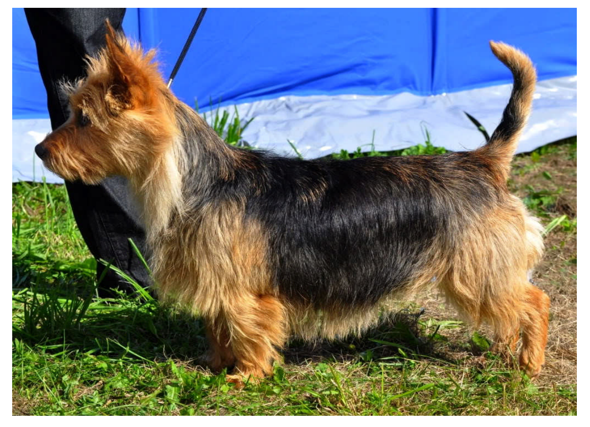
#9- Surely Nothing To Lose "Silja" (Bitch) Owners: Birthe & Ole Buch 131 Points <a href="http://www.australsk-terrier.com/">http://www.australsk-terrier.com/</a>