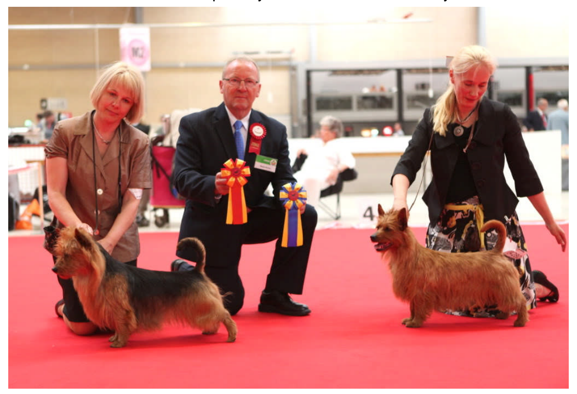
The Winners at the World Dog Show