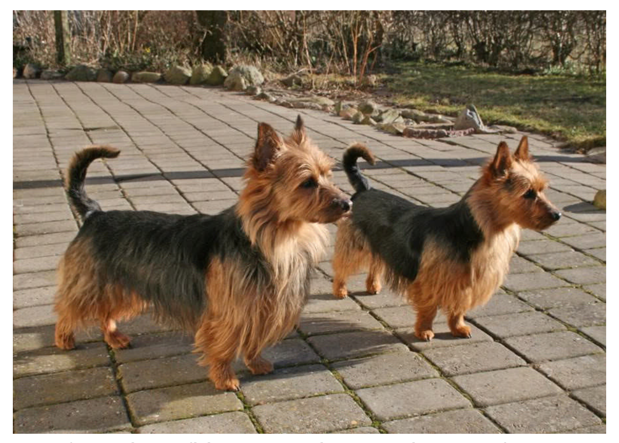
Do you feel ATI is beneficial to the Aussie breeders in Denmark? Yes indeed I do! I am enjoying the newsletters very much. Thank You VERY MUCH for all the work you all do!

What I find particularly useful is that I find some of the breeders don't have websites and I can't find photos of their dogs. Sometimes I get lucky and find the photos of a certain dog either on the ATI website or in the ATI newsletters. It is a great resource.