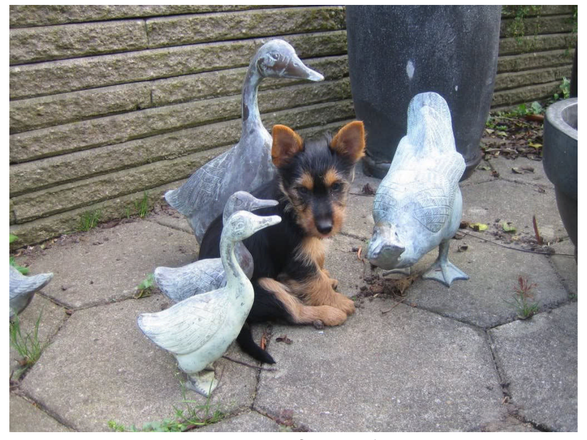
All Photos in this article Courtesy of Irene Thye. They may not be reprinted without her permission.