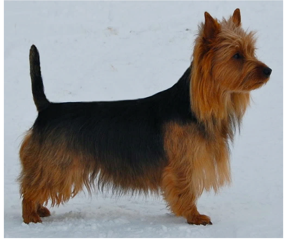
#8- Avocations Lights Of Moon "Luna" (Bitch) Owner: Jorgen Gronlund 143 Points <a href="https://www.blueayers.dk">www.blueayers.dk</a>