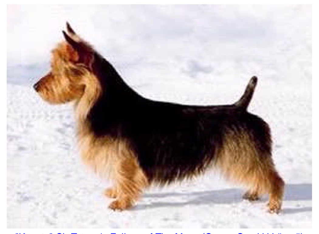
"Konsta" Ch Tatong's Eclipse of The Moon (Owner Orvokki Lämsä)