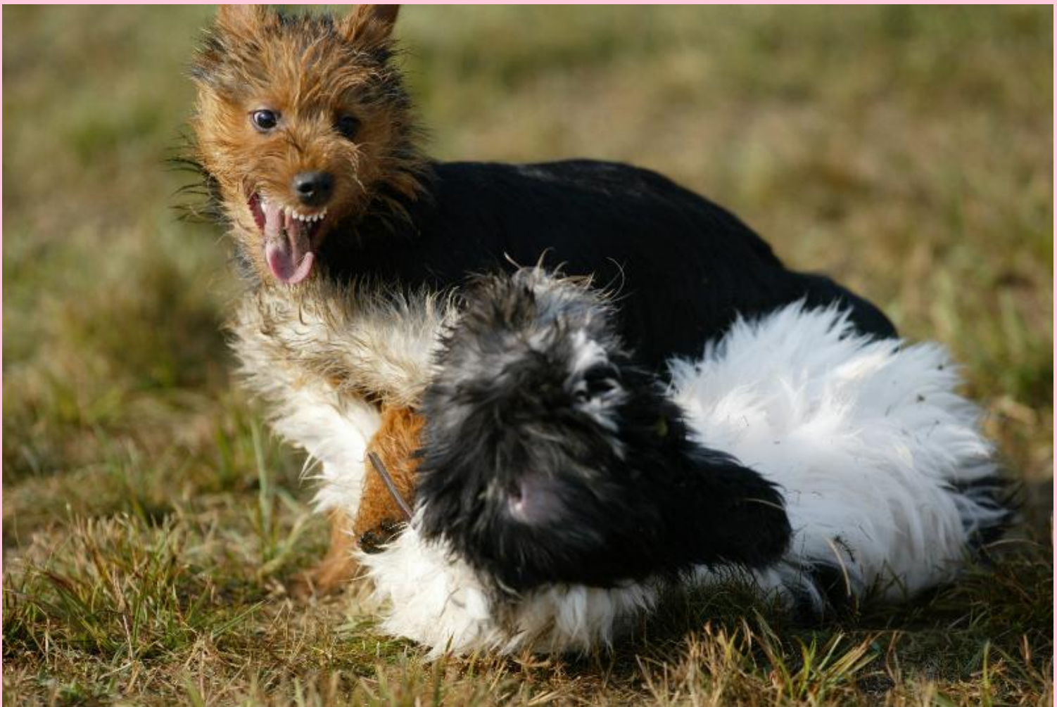
"Alfie and Zeta at Camp Gone To The Dogs"