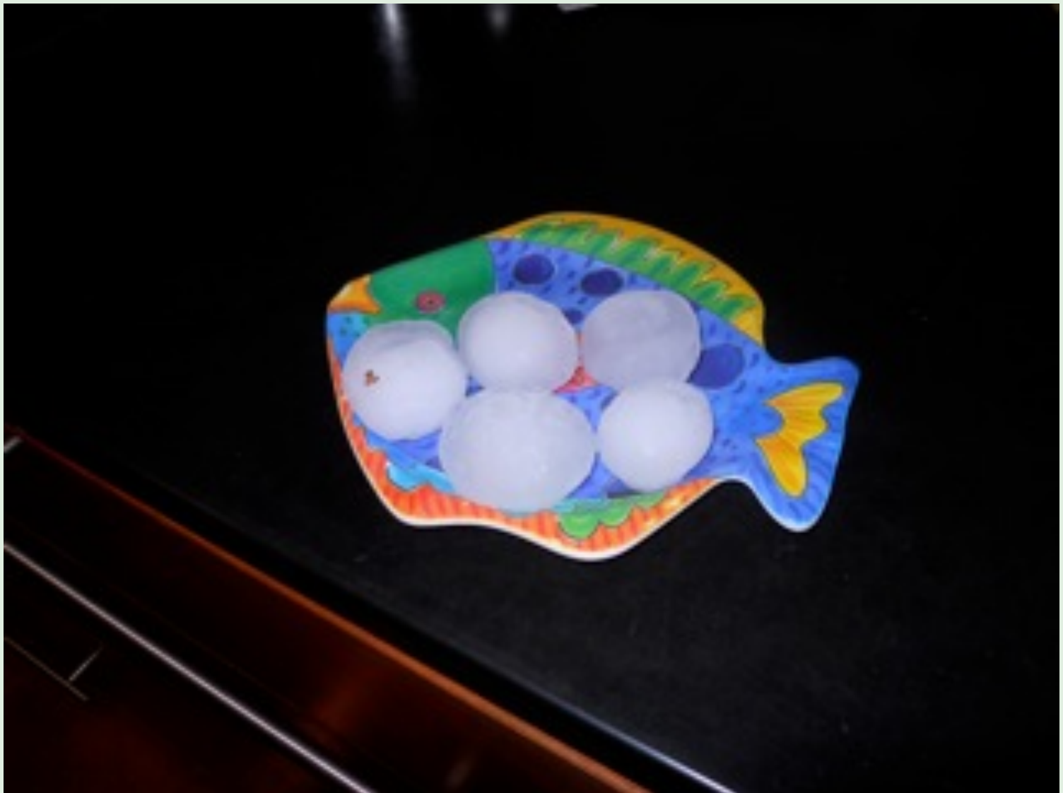
Golf Ball Sized Hail

They are a tough, hardy dog that will always put a smile on your face. Cody ran around the yard playing joyfully with the golf ball sized hail and loving every minute of it! He was oblivious to the severe weather that just passed and happy to have the family together that stormy May Day.