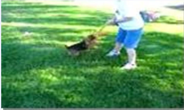
Reward your dog when they do something well. Tug is a big reward for Wally.

Another form of jackpot is a special game or extended playtime. Break off training and immediately begin to play with the dog for a longer than usual period of time or use both treats and play.