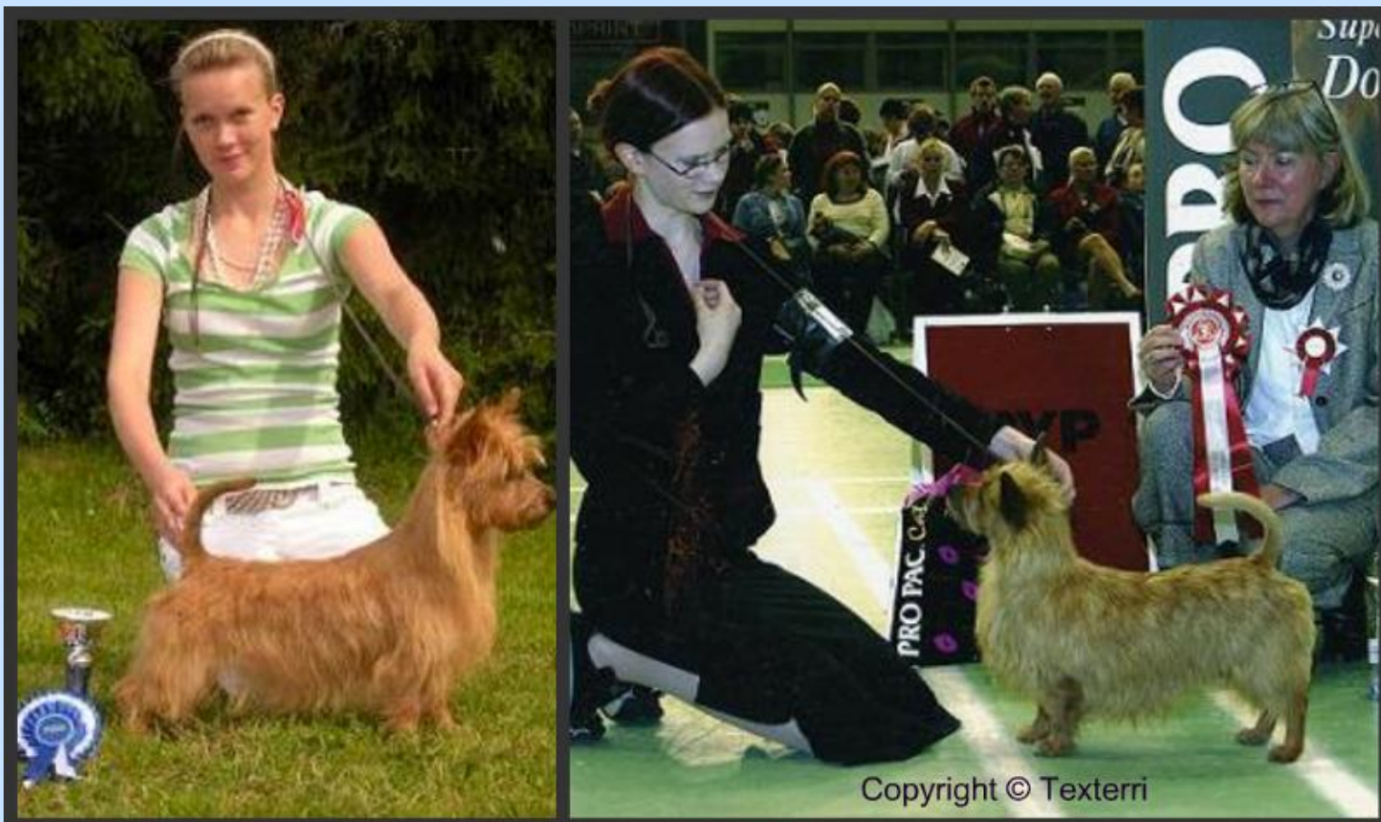
"Puhti" CH Surely Sexbomb to BOB

my friends) that is the main interest and so it will be.