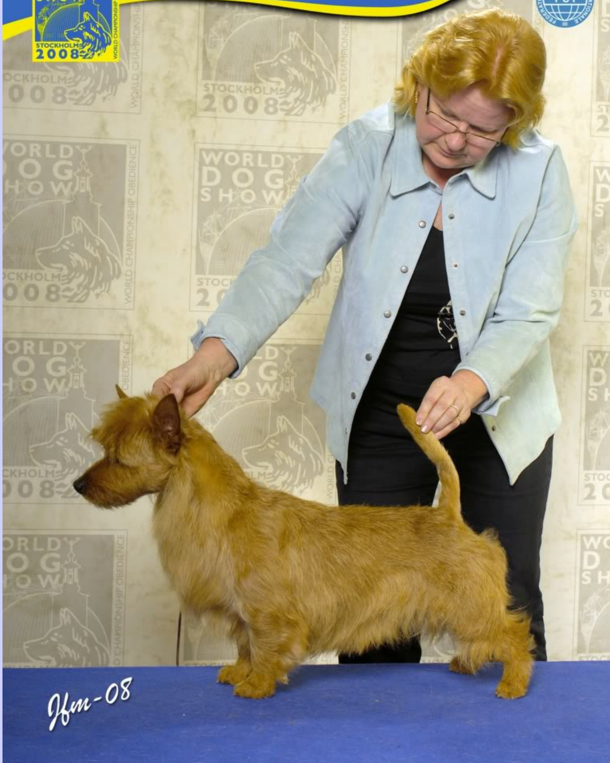
C.I.B, NORDIC, FI, DK, SE, RUS, EE, LV CH, EE VCH, VWW-08, BALTTW-09 AVOCATION CENTAURUS