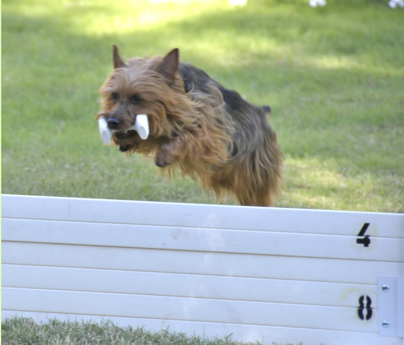
Benayr R Walkabout Wally CD RE NAC CGC NTD