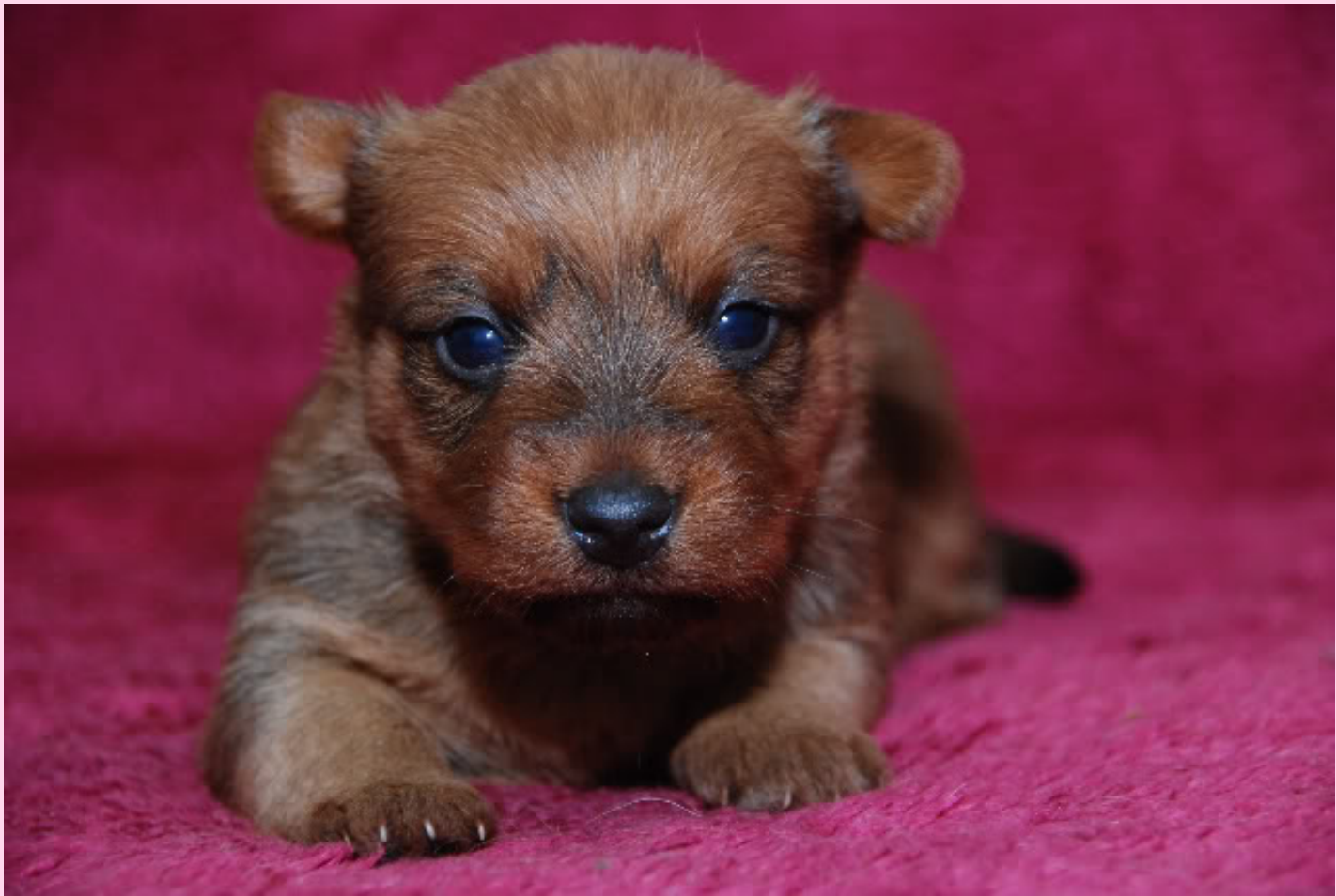
Good morning world.