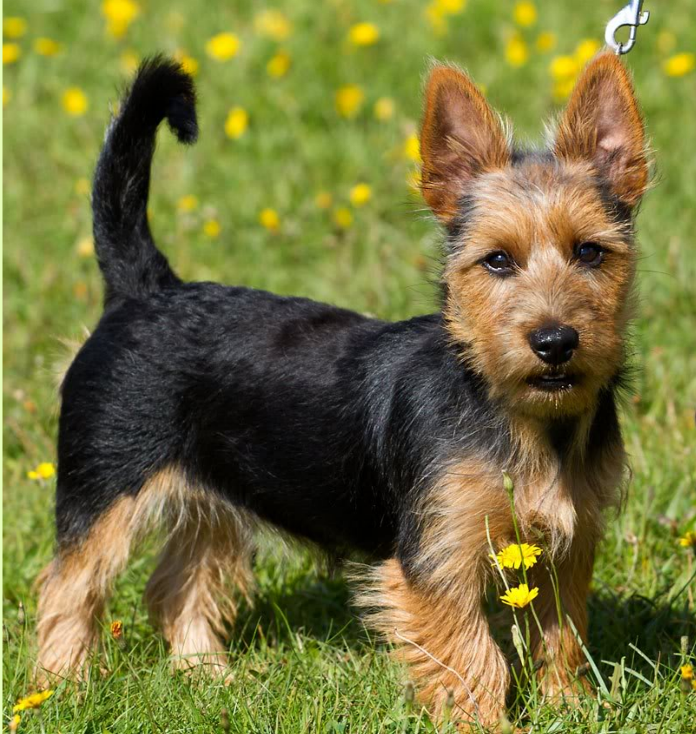
BluAyers Angelina "Nellie" out of Avocation Lights of Moon and Kisamba's Bluey Louis.

Not only has ATI connected me, as a member, with others who share my passion for Australian Terriers, it also has served as a global network of experienced Aussie owners whose knowledge of the breed is invaluable for first-time Aussie owners.