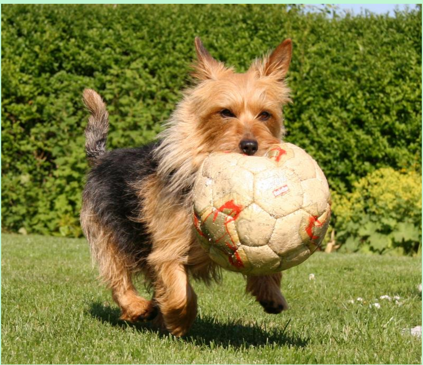
"Silja" loves to play football.