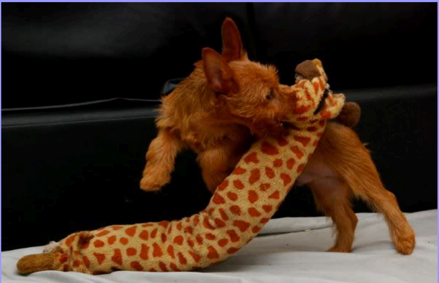
Aussies were bred to kill snakes. Don't you think everyone needs an Aussie?