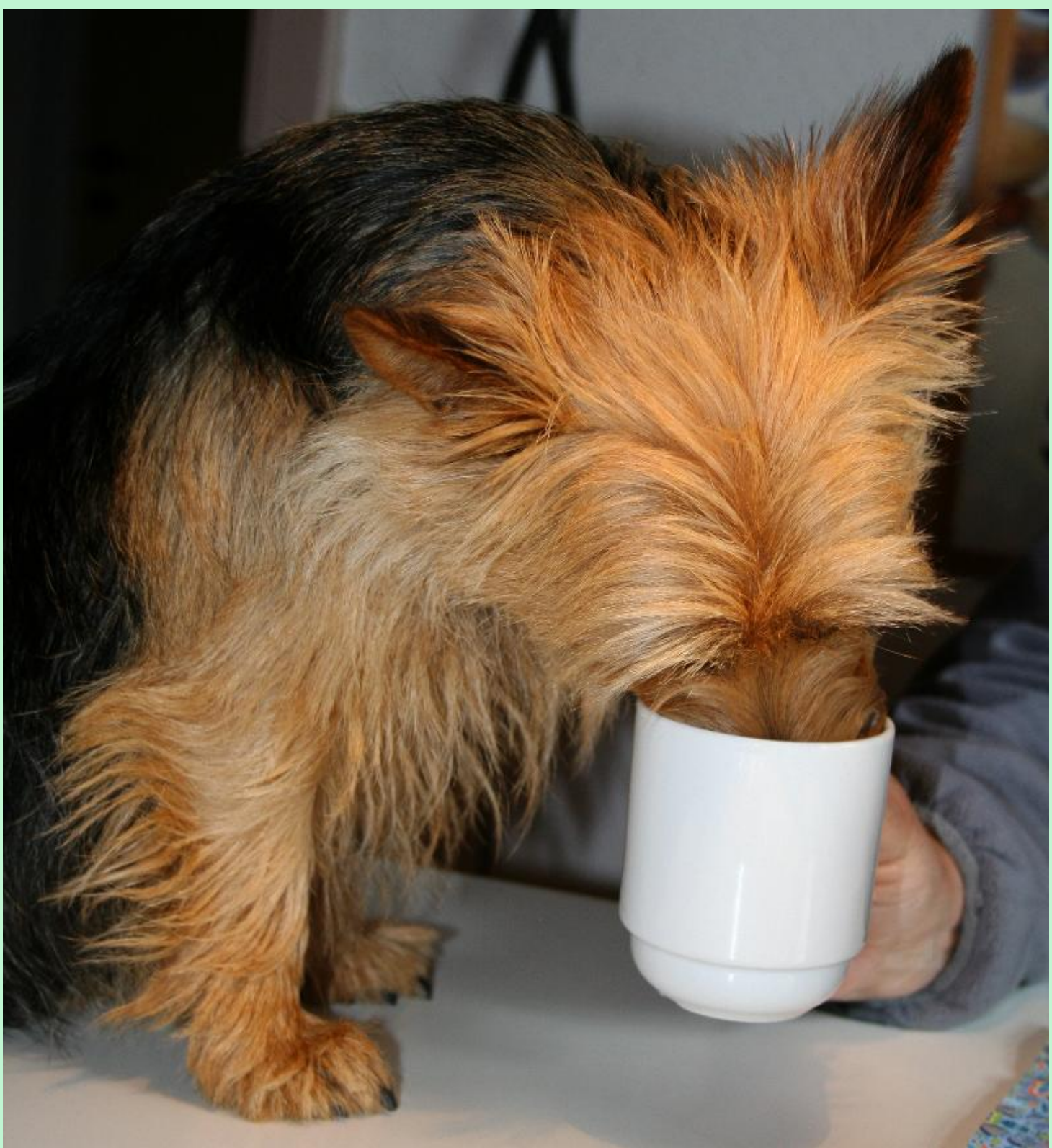
When she finishes football, she loves to have a glass of milk. "Silja", Surely Nothing To Lose