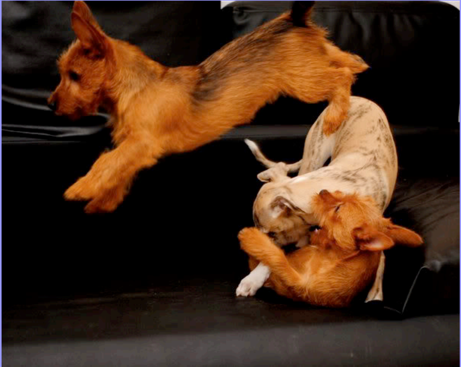
Leapin Aussies know how to have a good time.