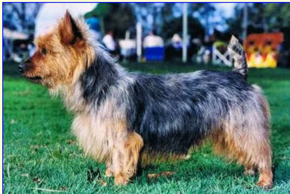
Australian Ch Redgundi Sara Lee "Tuppence", my very first show Aussie. She has a blue coat.

I have been breeding dogs for 40 to 45 years. I had different breeds until I got the Aussie.