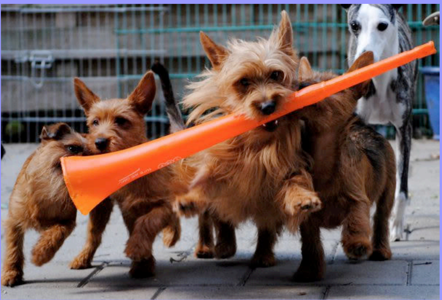
Aussies love a good parade.