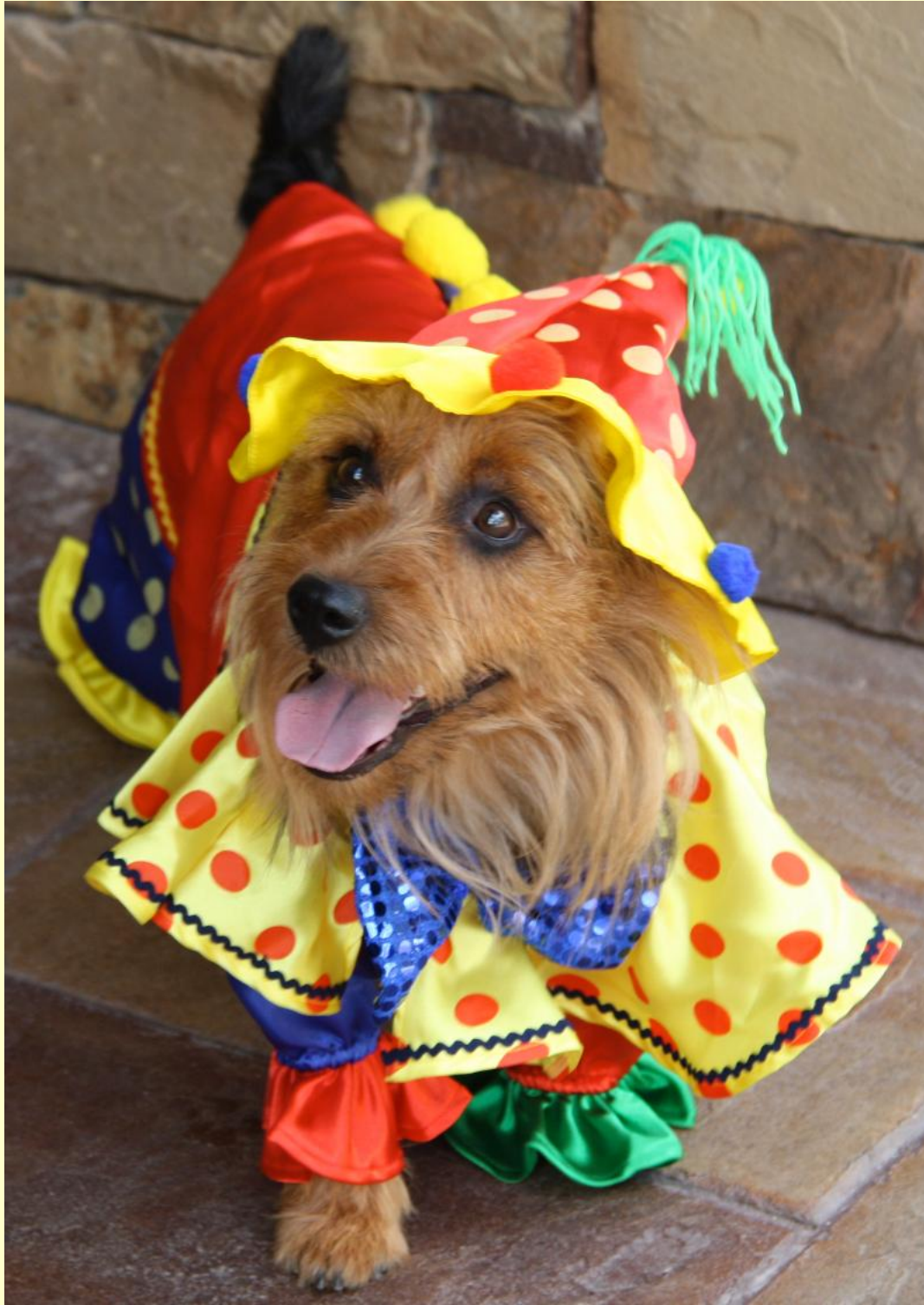
"Rocky" the Clown

To see how many different countries celebrate Halloween click here .