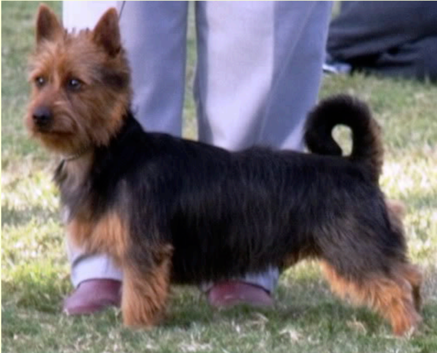
Taufield Anzac Utu. He is a 12 inch 7 kilo dog. He is now in Germany at Va Bene Kennels

That I tried to breed a good Aussie with a wonderful temperament remaining true to the standard. As a breeder, I gave help to everyone I sold a pup to regardless of whether it was a show or pet puppy. I would also like to be remembered that I loved the breed and it was always first with me.