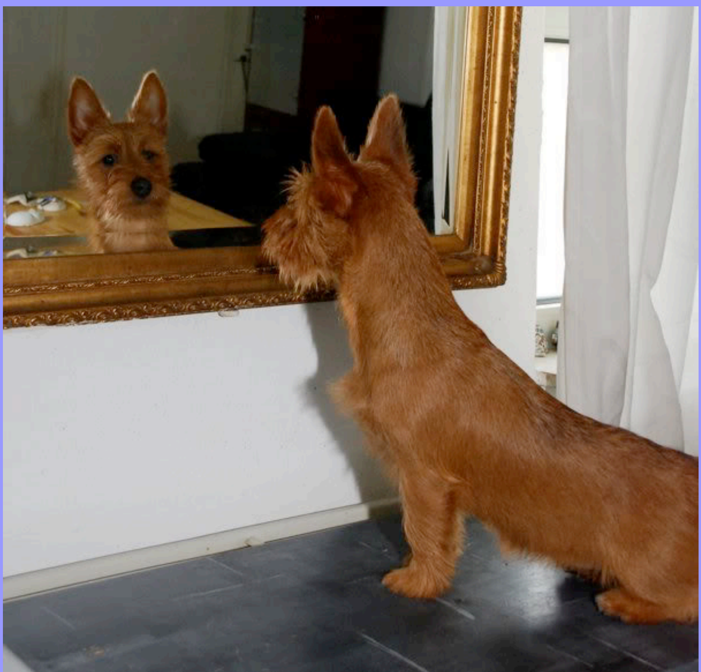
Aussies can be reflective and occasionally vain.