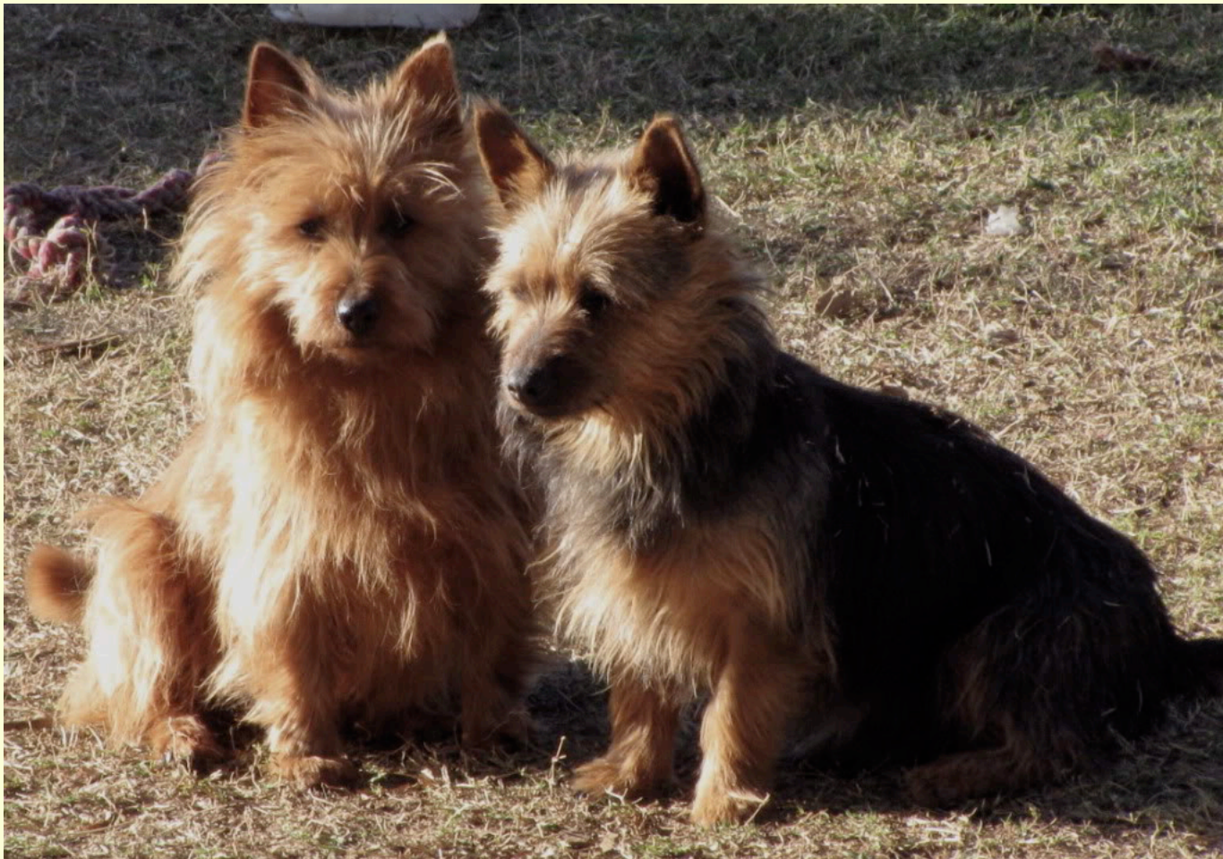
Faye & Wart "Taufield Fayes Gold & Taufield Warts Gift" enjoy the sun

I have bred 42 litters of Aussies. I have kept 1 or 2 pups from every litter I have bred and taken most of them through to their Championship. I have given a lot of people a pet to be proud of.