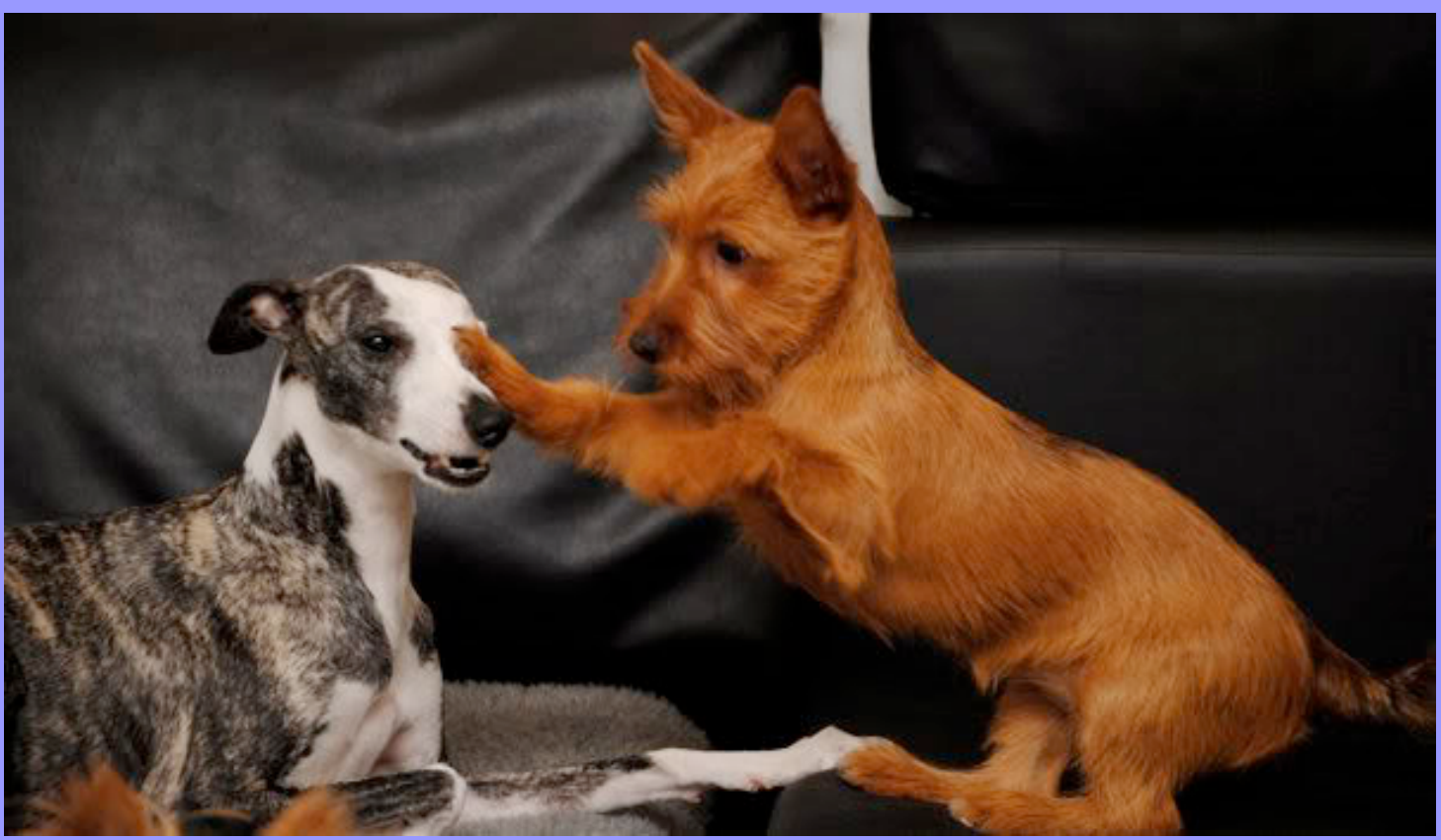
Aussies can be very friendly and loving.