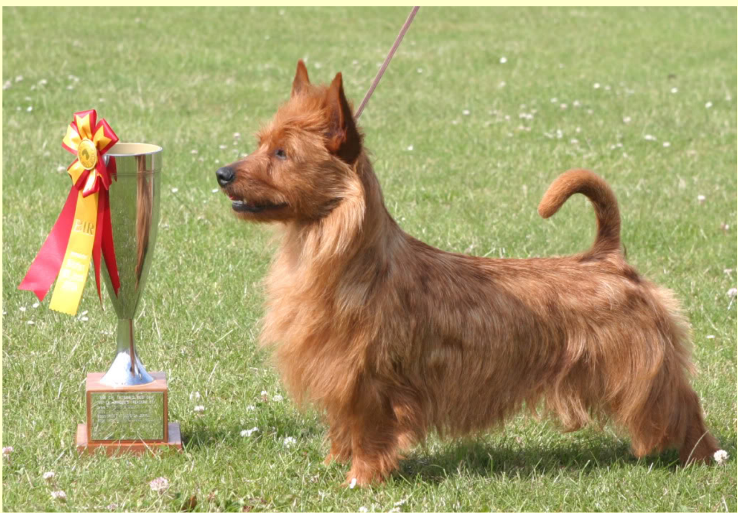
CH. Bluepepper's Funny-Bunny "Selma"

2nd Best Bitch (Females / Veteran Class) C.I.B. FI SE NO NORD CH, JW-01 NORDW-05. VetWW-10 Bluepepper's Black Mint FIN11262/01 d.o.b. 16.11.2000 Sire: Bluepepper's Tomahawk Dam: Bluepepper's Ginger Ale Breeder: Marjo Ahola, Sotkamo Owner: Jaana Saloniemi