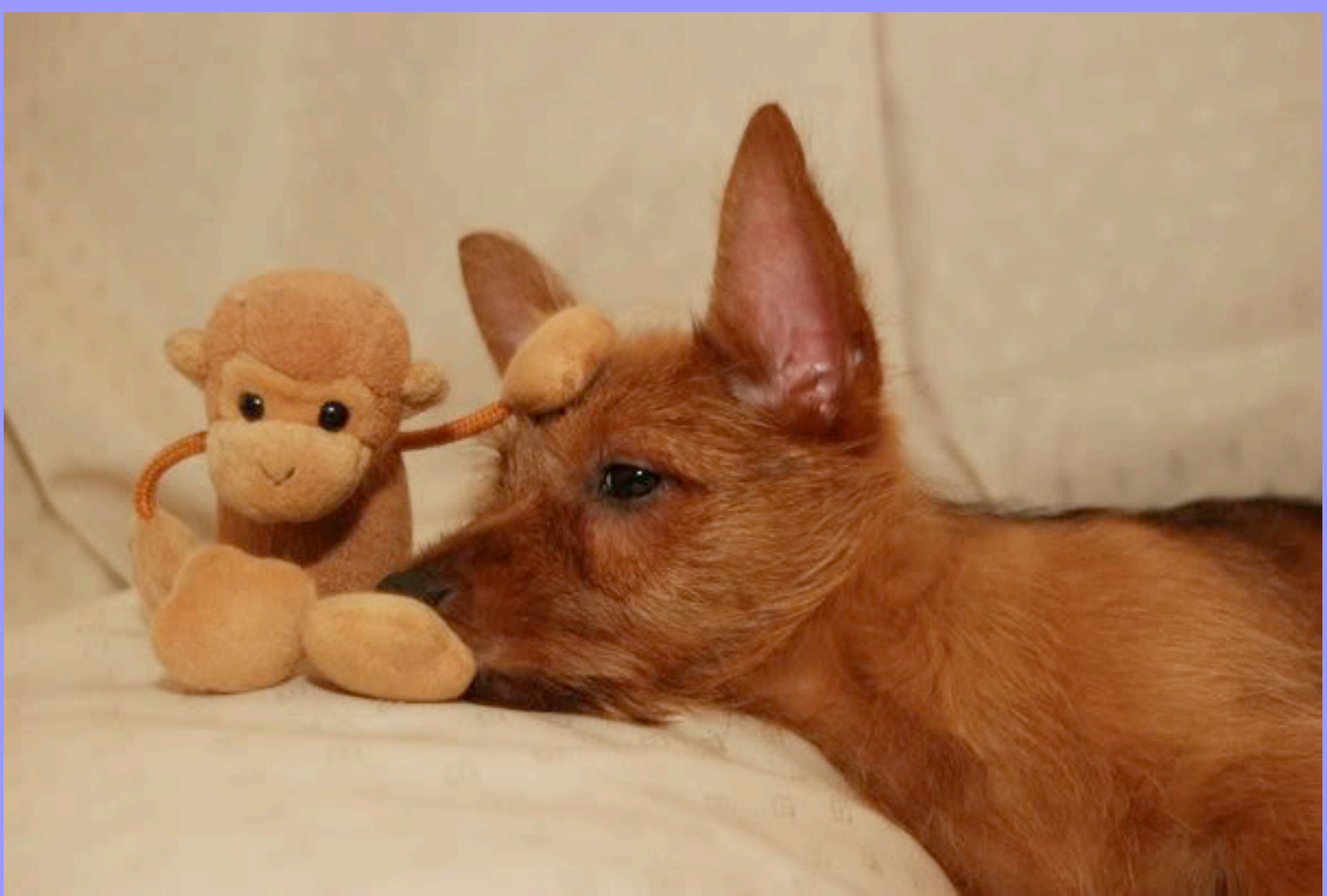
Aussies enjoy friendship even if their friend is stuffed.