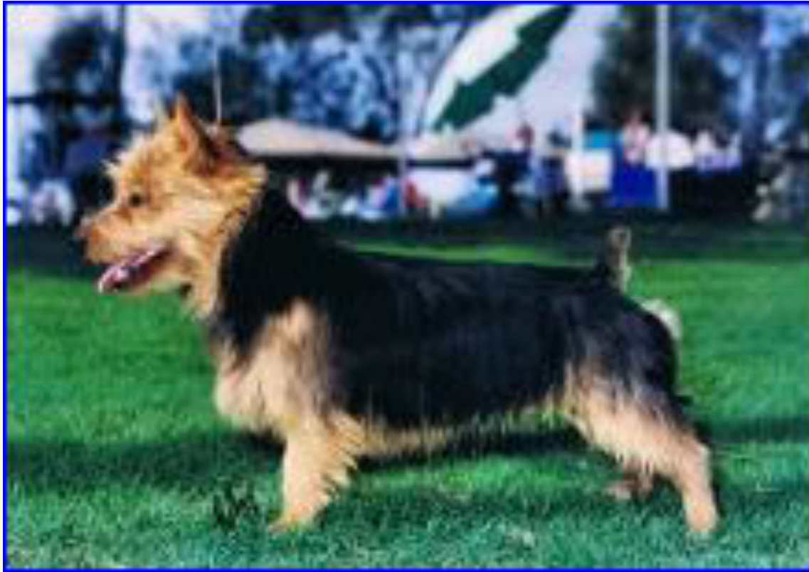
Australian Ch Maymuru Mighty Mouse, "Bouncer", my first male Aussie.