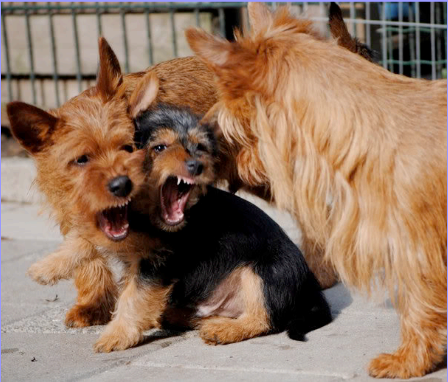
Aussies can sing.