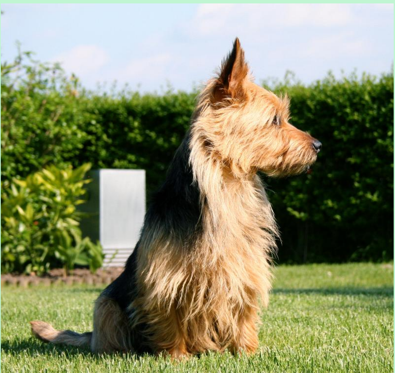
"Silja" is 3 1/2 years old.