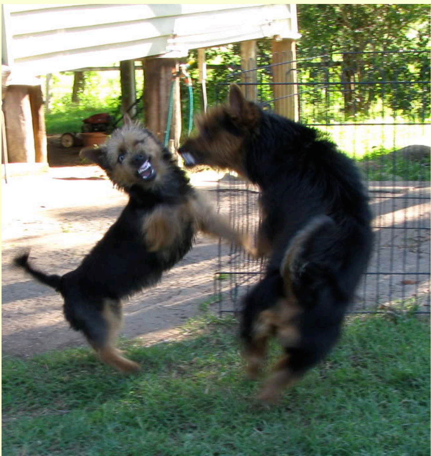
Wart & Shadow "Taufield Warts Gift & Wanora Last Gift" Having a lovely play in the yard.